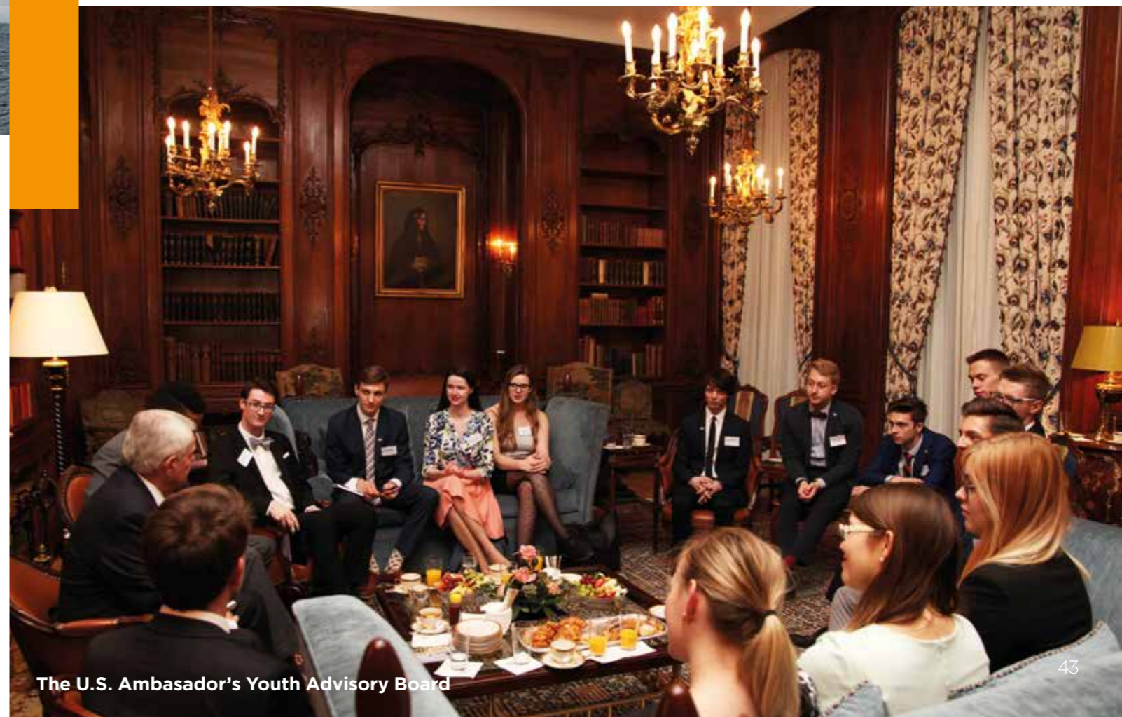
The U.S. Ambassador's Youth Advisory Board