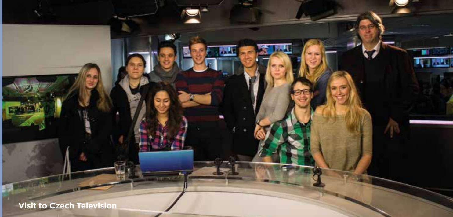
Visit to Czech Television