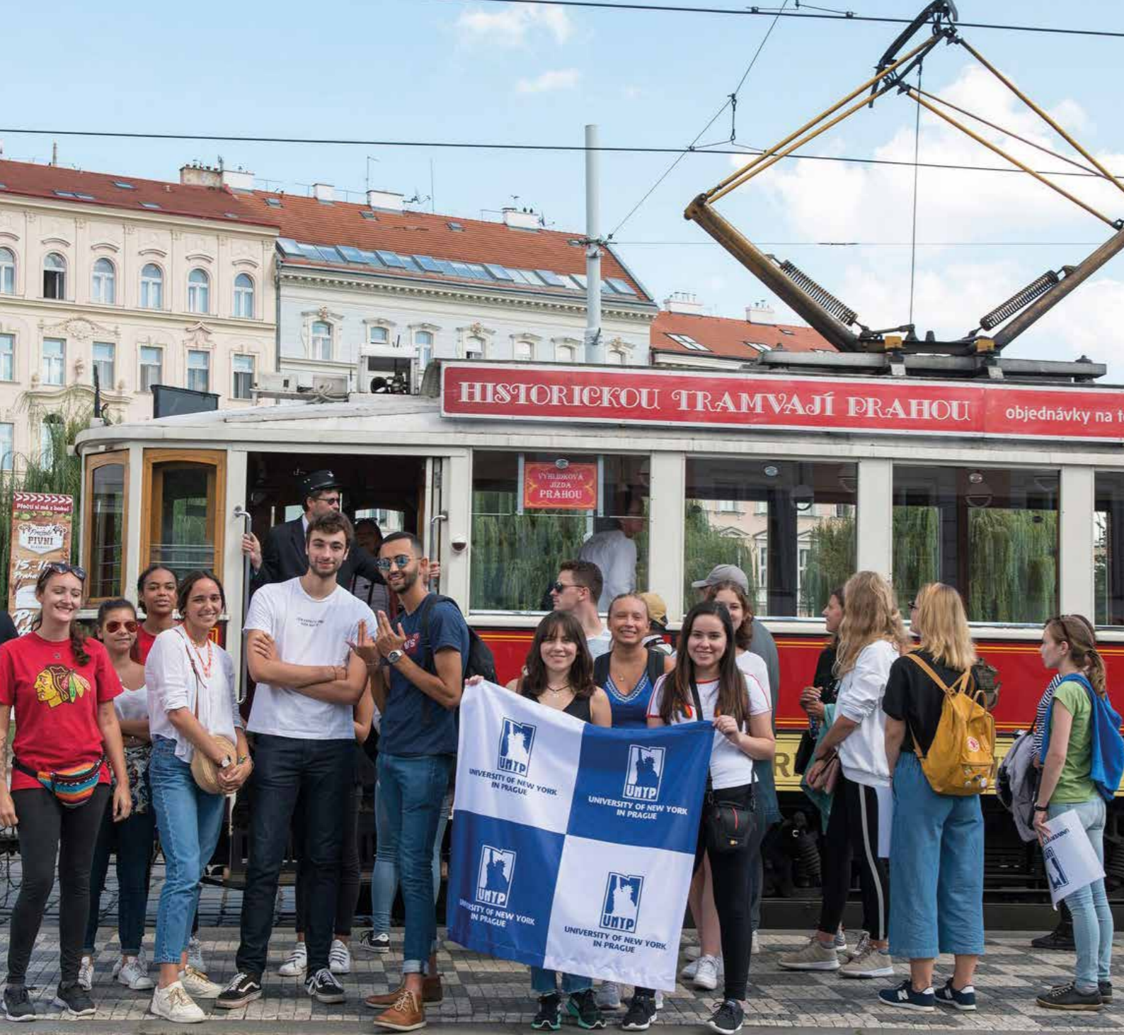
Study Abroad Students in Prague