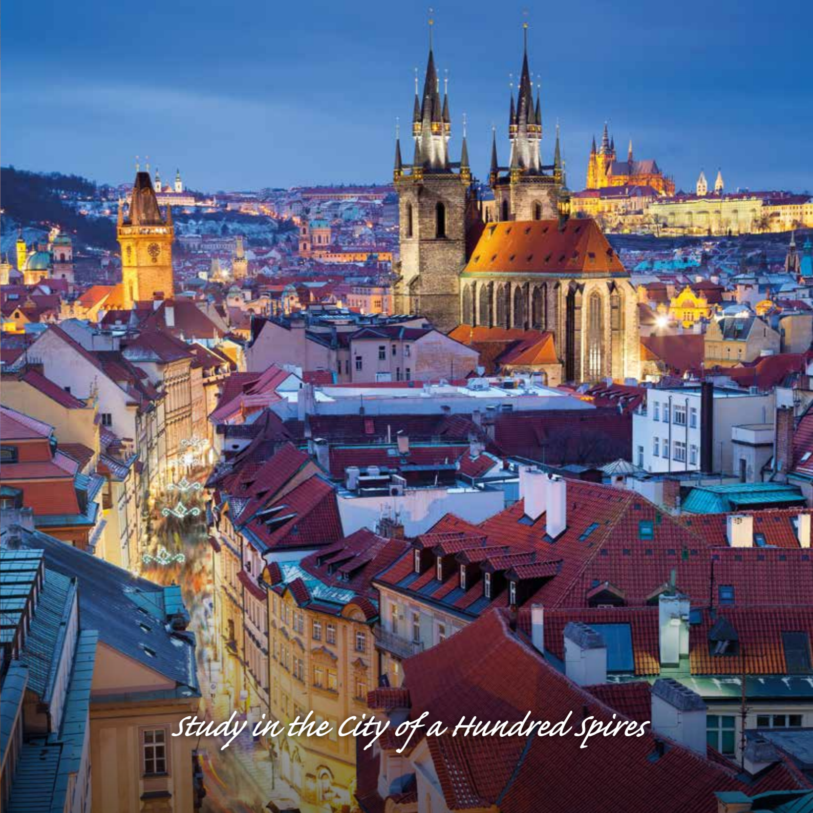
Study in the City of a Hundred spires