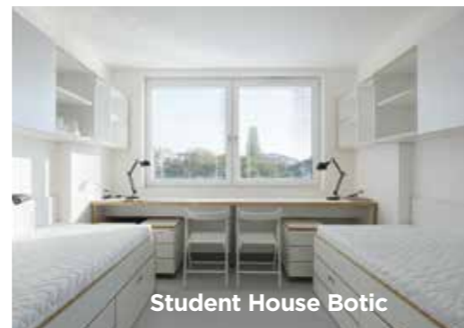
Student House Botic