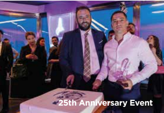
25th Anniversary Event