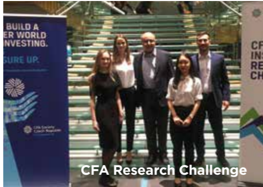
CFA Research Challenge