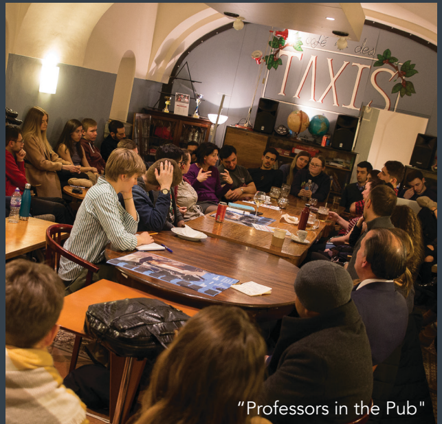
"Professors in the Pub"